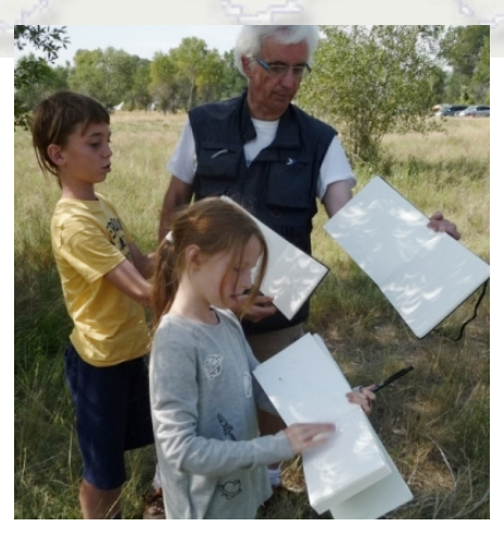
What I like to do with children is to use the pinhole effect, very safe, this is the diffraction of the sun light through some holes in tree leaves.